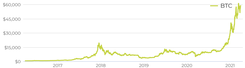
BTCUSD is represented as a proxy illustration to represent the historical performance of a Bitcoin. This index is quoted in USD and in no way represents the future performance of the Purpose Bitcoin ETF. Mar 31, 2021.